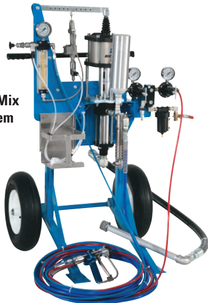
17:1 External Mix Gel Coat System

Get a responsive fluid section with ball checks optimized for medium to heavy viscosity materials