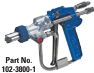
Part No. 102-3800-1

Binks Century LEL External Mix Chopper gun